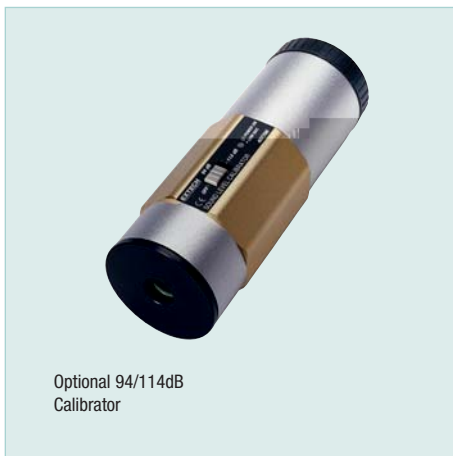
Optional 94/114dB Calibrator