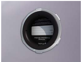
Single PIRma-Lock™ ring nut.