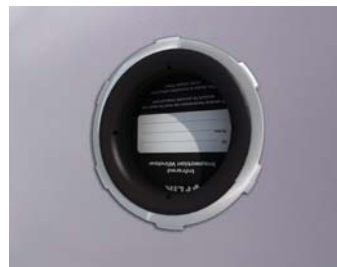
Single PIRma-Lock™ ring nut.