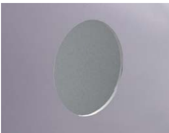
One hole to cut.