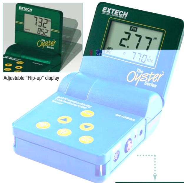
Adjustable “Flip-up” display